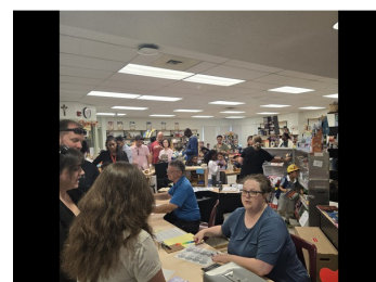
Book Fair/Open House