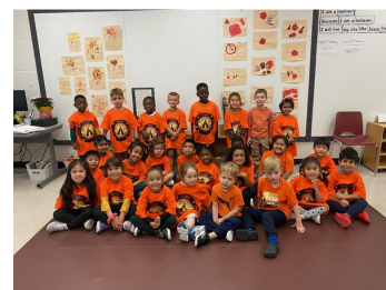
Orange Shirt Day