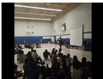
Student council speeches