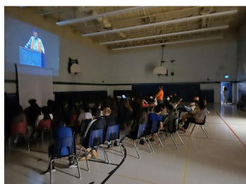
Truth and Reconciliation Presentation